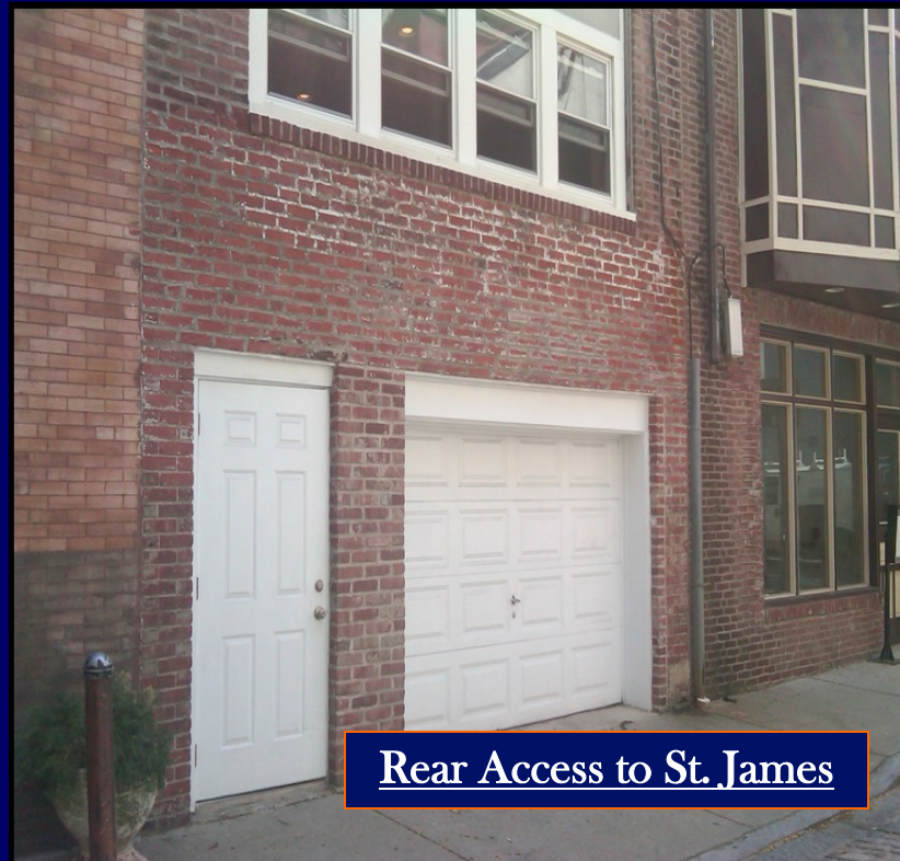
Rear Access to St. James